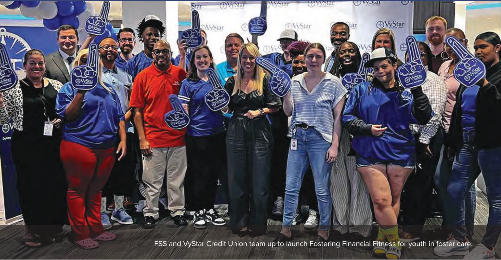
FSS and VyStar Credit Union team up to launch Fostering Financial Fitness for youth in foster care.

When young people age out of foster care, the path to adulthood can feel steep—especially without access to basic financial tools many families take for granted. In 2022, approximately 18,500 youth nationwide exited foster care without being adopted, and locally more than 1,200 were in out-of-home care (as of March 2025), including 360 youth ages 13 to 23 in foster care extended foster care, or other FSS programs.